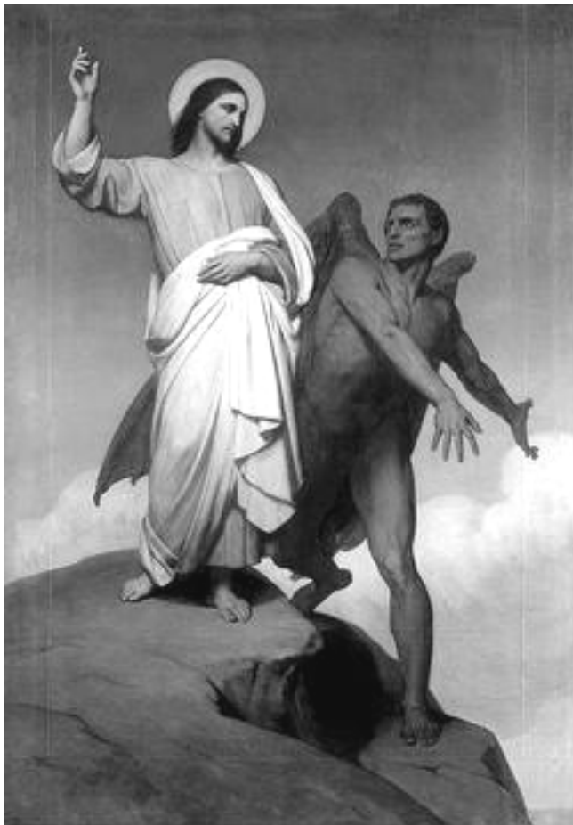
Christ tempted in the desert!