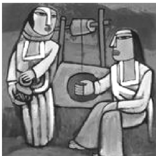
The Samaritan Woman at the Well

The Third Sunday of Lent 2017 March 19, 2017