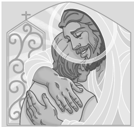
Your reward will be great in heaven